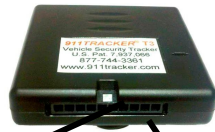
T3 Tracker (Front View)